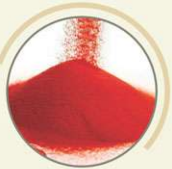
Spray Dried Tomato Powder