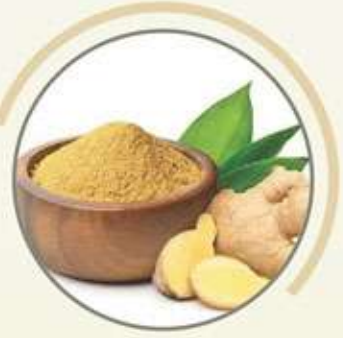
Dehydrated Ginger Powder