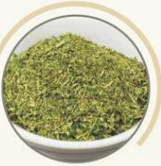
Dehydrated Coriander Leaves