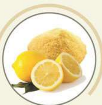
Spray Dried Lemon Powder