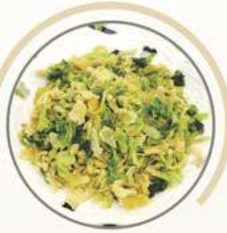
Dehydrated Cabbage Flakes