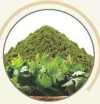
Dehydrated Coriander Leaves Powder