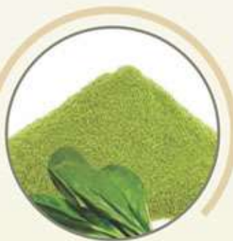
Dehydrated Spinach Powder