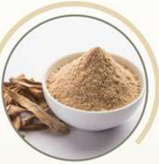
Dehydrated Aamchur Powder