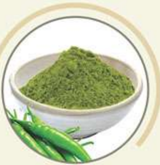
Dehydrated Green Chili Powder