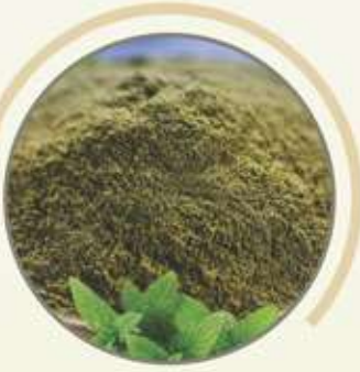
Dehydrated Mint Leaves Powder