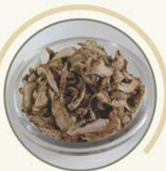
Dehydrated Ginger Flakes