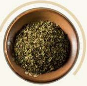
Dehydrated Mint Leaves