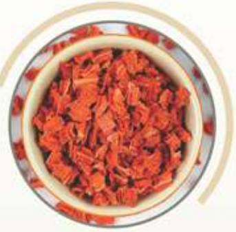
Dehydrated Carrot Cubes