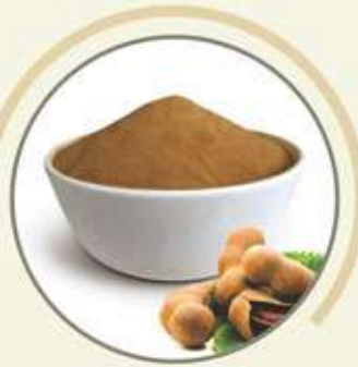
Spray Dried Tamarind Powder