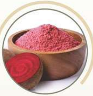
Dehydrated Beetroot Powder