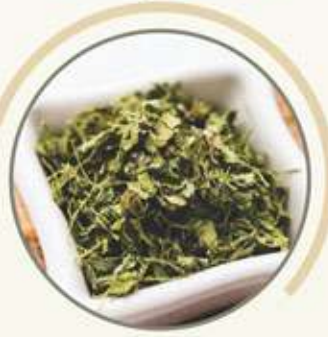
Dehydrated Kasuri Methi